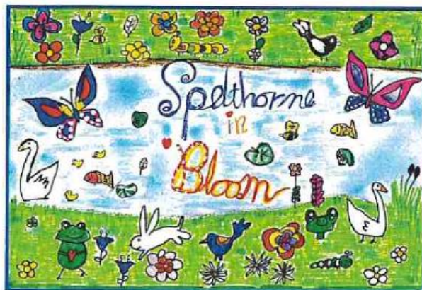
2025 Winning Entry

Last week, this year's Spelthorne in Bloom competition was introduced to the children in assembly. The theme for this year is Trees and the judges are looking for vibrant, colourful images with trees, flowers and any natural elements which remind children of Spelthorne. Posters must include the words "Spelthorne in Bloom" and judges encourage imaginative designs. All posters must include the child's name, age and school written on the back of the entry.